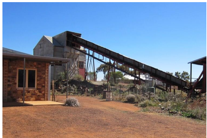
Historic Paynes Find Battery. The only privately owned and operated stamp battery in W.A.