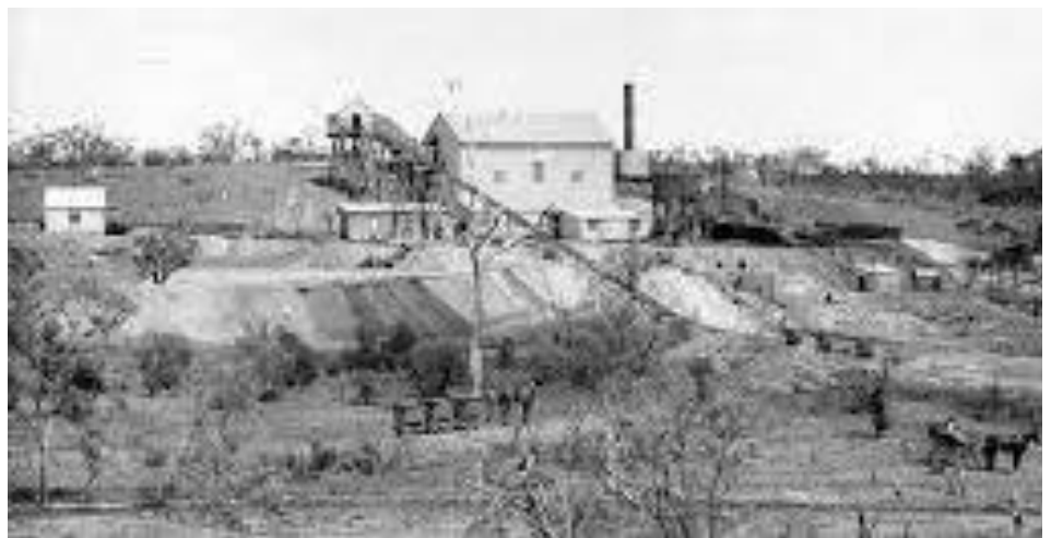
Flagstaff goldmine 1900 Coolgardie

Remember safety in the bush is paramount, make sure your radio, GPS and PLB are working correctly before venturing out.